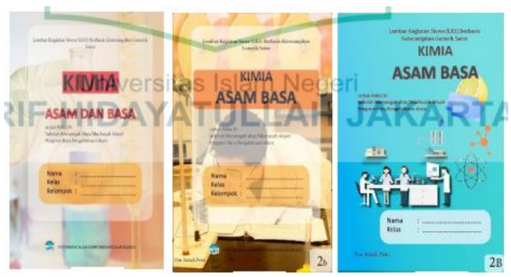
Figure 2. Improved LKS Cover Display Design