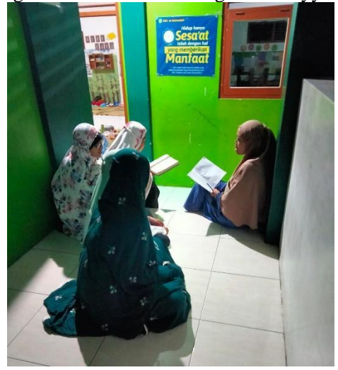
Figure 6. Evaluation through Mukhoyyam

This program is specifically for grade 6 students, but if students in grades 4 and 5 have met the memorization target, they are allowed to take part in mukhoyam. At the beginning of each semester, Tahfidz teachers have determined memorization targets for each class, starting from class 4, the target is to memorize 10 verses at each meeting. In Class 5, for each meeting, they still deposit 10 verses and in each semester students are asked to deposit 5 pages. At the beginning of the 6th grade semester, it was socialized that at the end of each semester there would be a mukhoyyam program so that students could prepare themselves to submit their memorization.