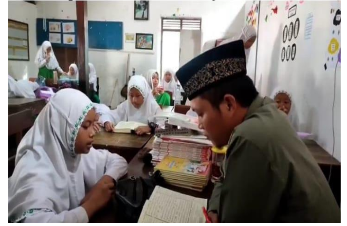
Figure 5. Memorization Deposits in Class

repeatedly until the students have memorized them. At each meeting students are asked to memorize 10 verses and submit them at the next meeting and if there are students who can deposit their memorization at that time they will be given a reward to appreciate, motivate and foster the students' competitive spirit.