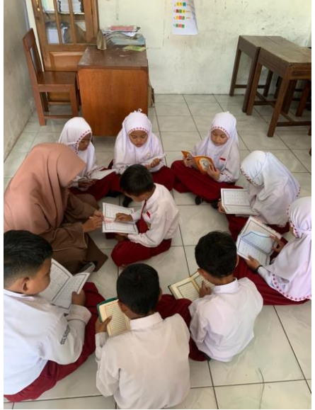
Figure 3. Muri-Q Learning Activities in Class

4). Learning Tahfidz Al-Qur'an. SDIT Al-Muhajirin Sawangan Magelang has two programs for memorizing the Al-Qur'an, namely through tahfidz subjects and aiming for tahfidz. The tahfidz subject has been around for a long time, but the methods used are less effective so that many students do not meet the targets set by the accompanying teacher. Meanwhile, Bidik Tahfidz is a collaborative program launched by SDIT Al-Muhajirin Sawangan Magelang school with Rumah Qur'an which is also under the auspices of the Muhajirin Bahari foundation and has only been running for about 3 years. This Bidik Tahfidz