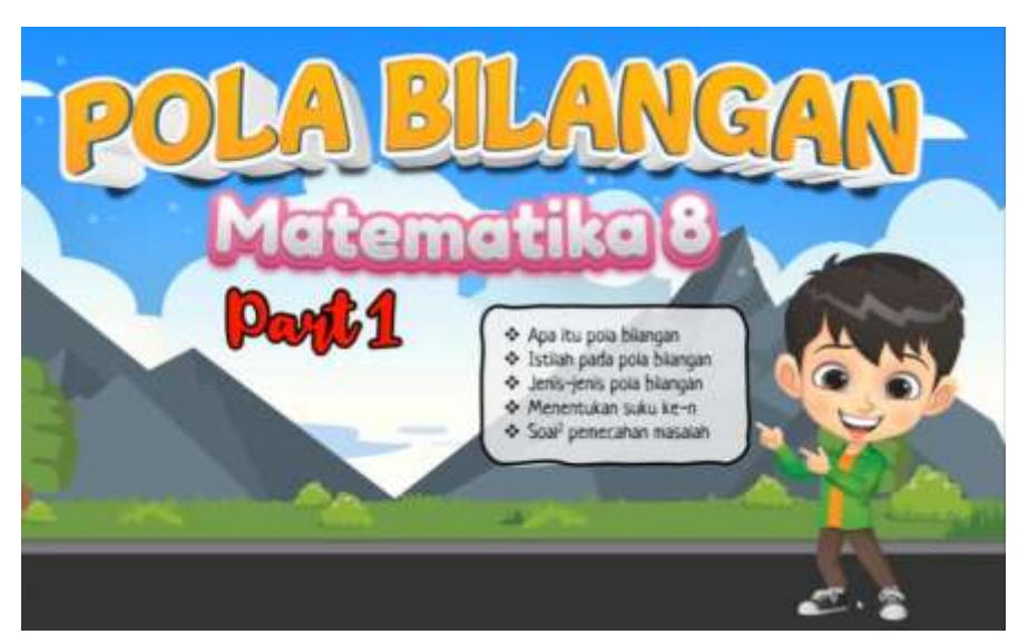
Figure 2. Initial View of Video Tutorials

The video tutorials used in this study can be seen on the <a href="https://youtu.be/Ky-7-1qbmLA">https://youtu.be/Ky-7-1qbmLA</a> page. The initial display image of the tutorial video is as follows: