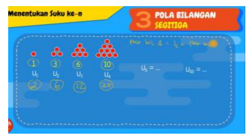
Figure 3. Material Display in Video Tutorials

The video tutorial contains an explanation of the Number Pattern material that can be accessed by students anytime and anywhere. Researchers as teachers instruct students to download tutorial videos at school because schools have a wireless network available so that students can look back at tutorial videos at home as a form of repetition of learning at home, especially during Online learning as a result of the Covid-19 outbreak. One of the material displays in the tutorial video is as follows: